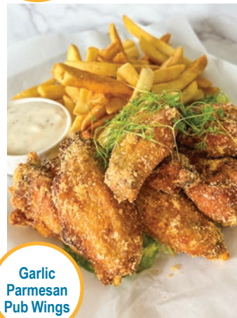
Garlic Parmesan Pub Wings