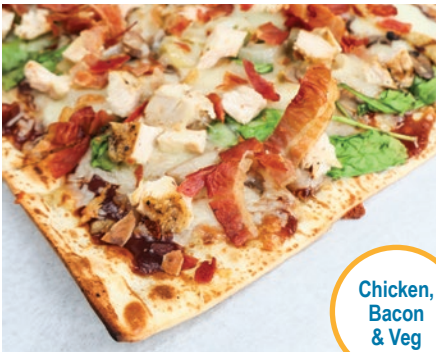
Chicken, Bacon & Veg