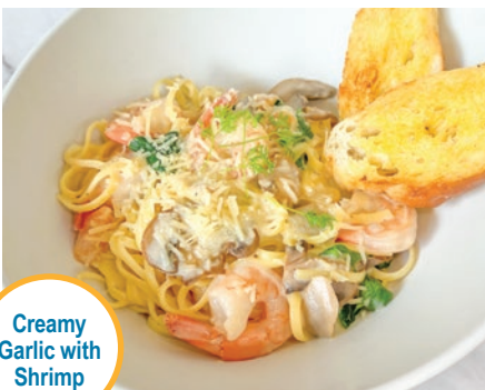
Creamy Garlic with Shrimp

CONSUMING RAW OR UNDERCOOKED MEAT, POULTRY, SEAFOOD, SHELLFISH OR EGGS MAY INCREASE YOUR RISK OF FOODBORNE ILLNESS. All orders are subject to a 10% service charge. PHR Club, Wellness Center Member and Military discounts applicable. Not able to combine with other promotions or discounts. Price may be subject to change without prior notice. Restrictions may apply.